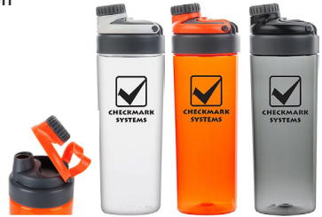
J49251 $10.99 27 OZ Tritan bottle with threaded dual opening lid, hinged cap and carry handle