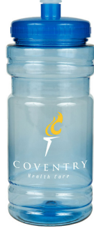
J404 $1.99 20 OZ Plastic Bottle