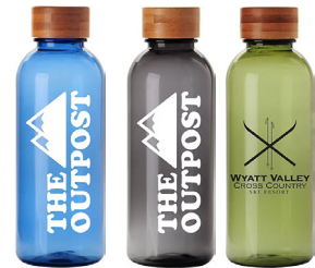
J400206 $6.99 20 OZ Recycled Plastic Bottle Bamboo Threaded Lid