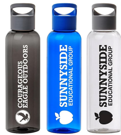
J400200 $6.99 24 OZ Recycled Plastic Bottle Matching Colour twist off carry handle lid