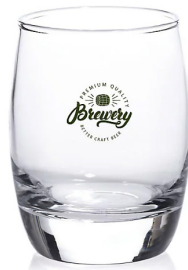
J1120 $3.99 6OZ drinking glass