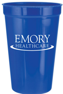
J0459 $1.49 22 OZ Plastic Stadium Cup