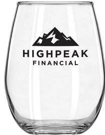
J50667 - $4.99 11.75 oz stemless glass