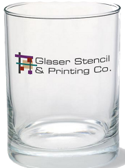
J50030 - $4.99 Clear 14 oz glass