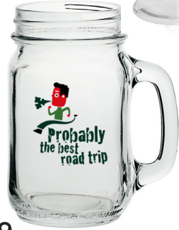
J50523 $3.99 16oz glass mason jar