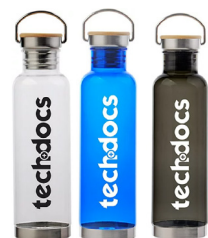
J46766 $9.49 27 OZ Plastic bottle with a bamboo lid and metal bottom