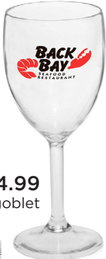
J52702 - $4.99 10 oz goblet